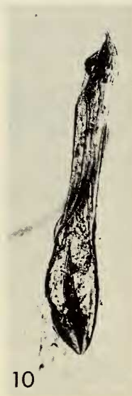
Figs. 7-10. Male genitalia of Scrobipalpa reiprichi Pov. Figs. 7-8. Norway, slide no. OK 4130. Figs. 9-10. Paratype, Czechoslovakia, slide POVOLNÝ (without number).